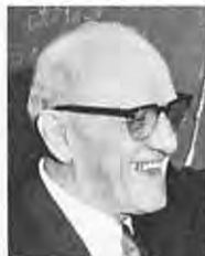
GEORGE S. HALAS

FORTY-NINE YEARS OF PROFESSIONAL FOOTBALL